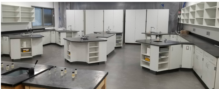
Junior/Senior High School remodeling on track: This classroom and science lab are already complete.