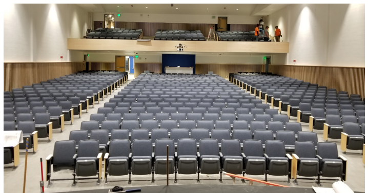
With new seating installed, the newly renovated junior/senior high school auditorium is nearing completion.